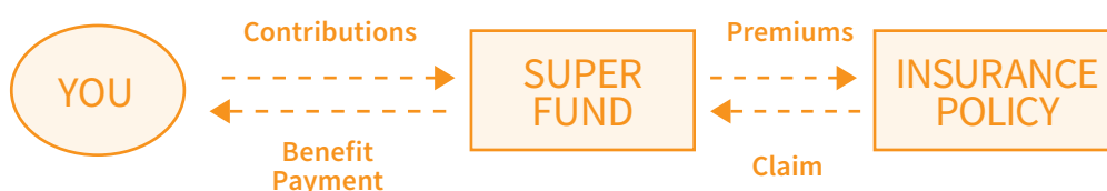
Figure 1. Flow of premiums and claim payments